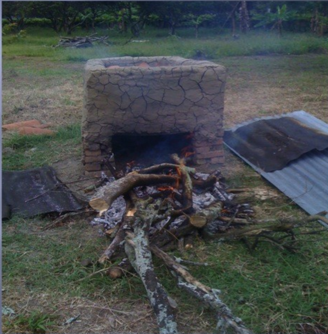
KILN BUILT WITH BRICKS AND MUD