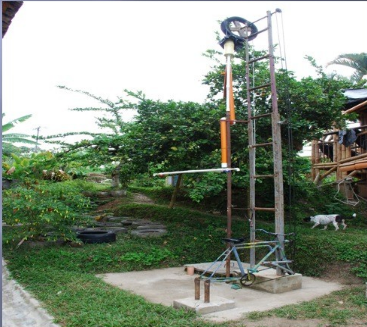
BICYSHOWERS AN ALTERNATIVE FORM OF ENERGY