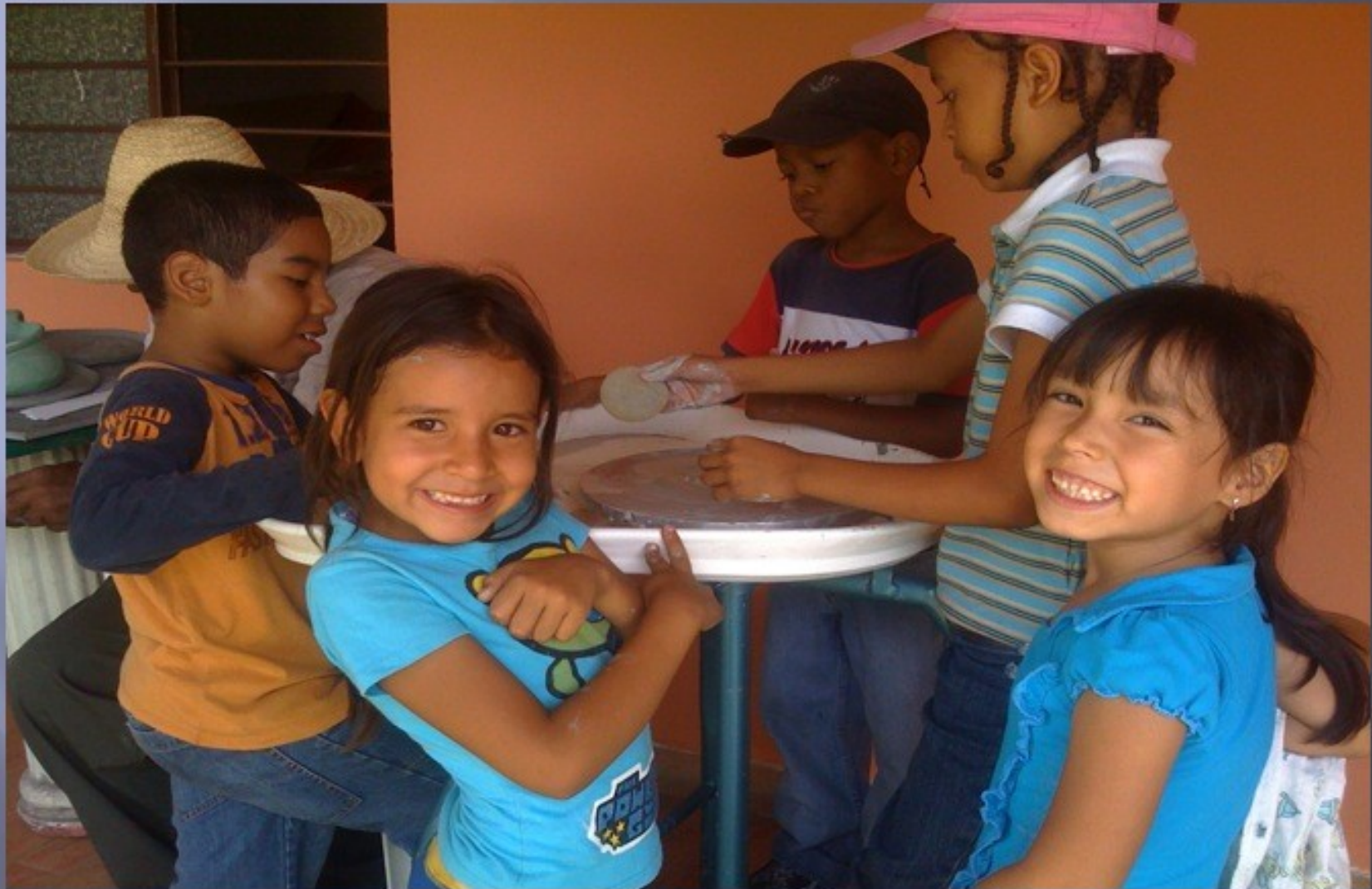
FOLLOWING THE ANCESTRAL TRADITION OF CERAMIC MAKING