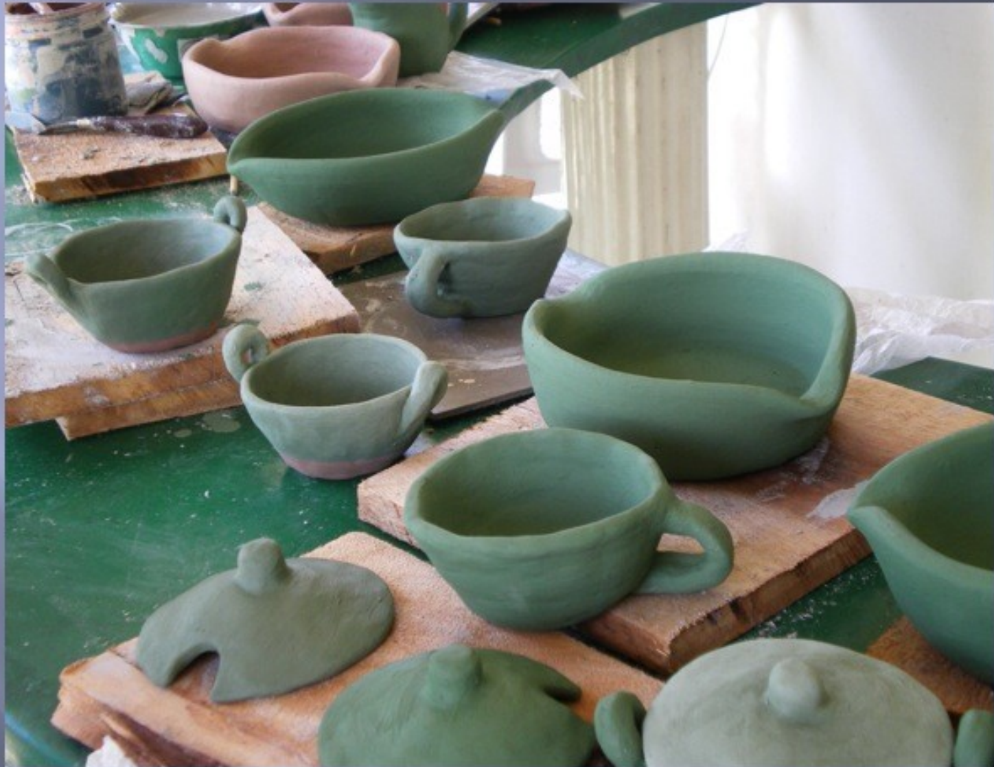
TABLE WARE MADE IN NASHIRA WITH TRADITIONAL METHODS