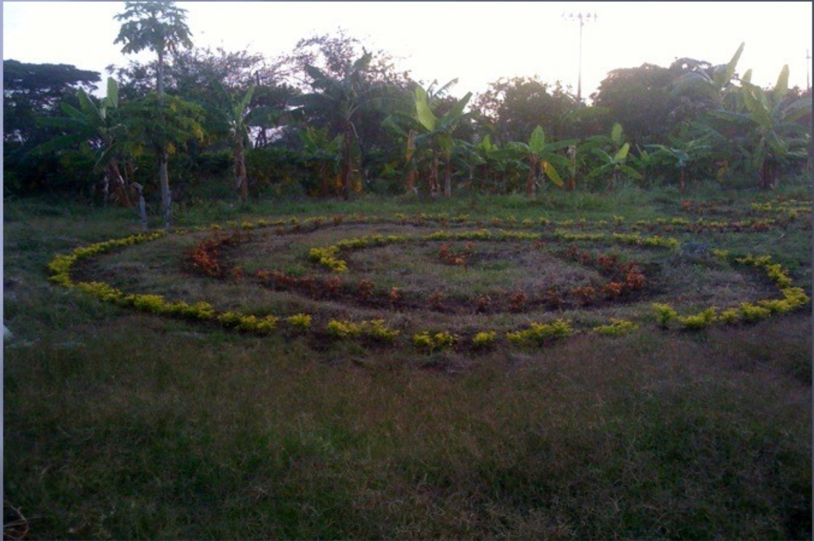
THE BEGINNING OF THE LABYRINTH