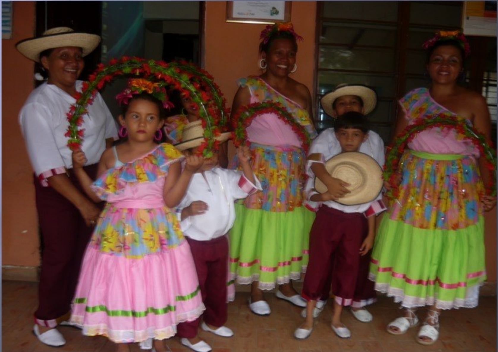
PARTIES ARE ALSO IMPORTANT