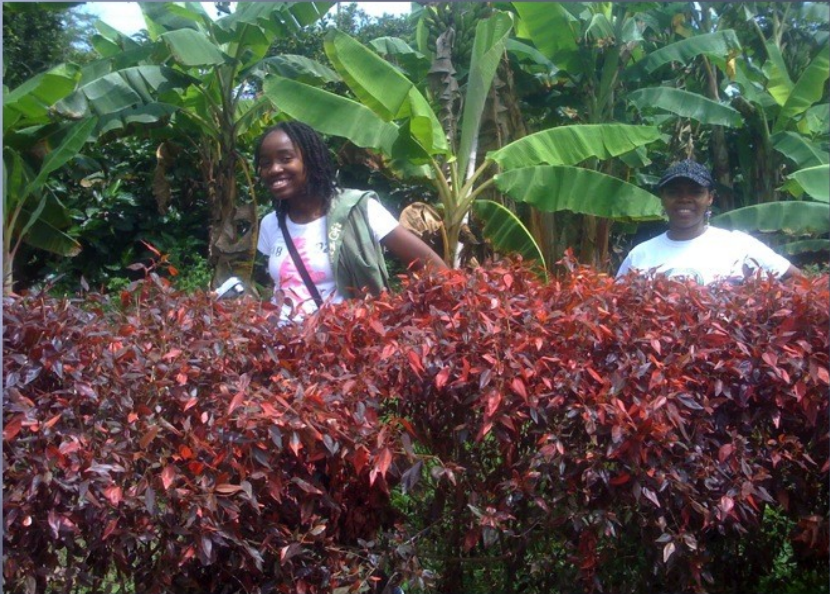
GETTING LOST IN THE LABYRINTH