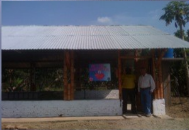
QUAIL EGGS PRODUCTION