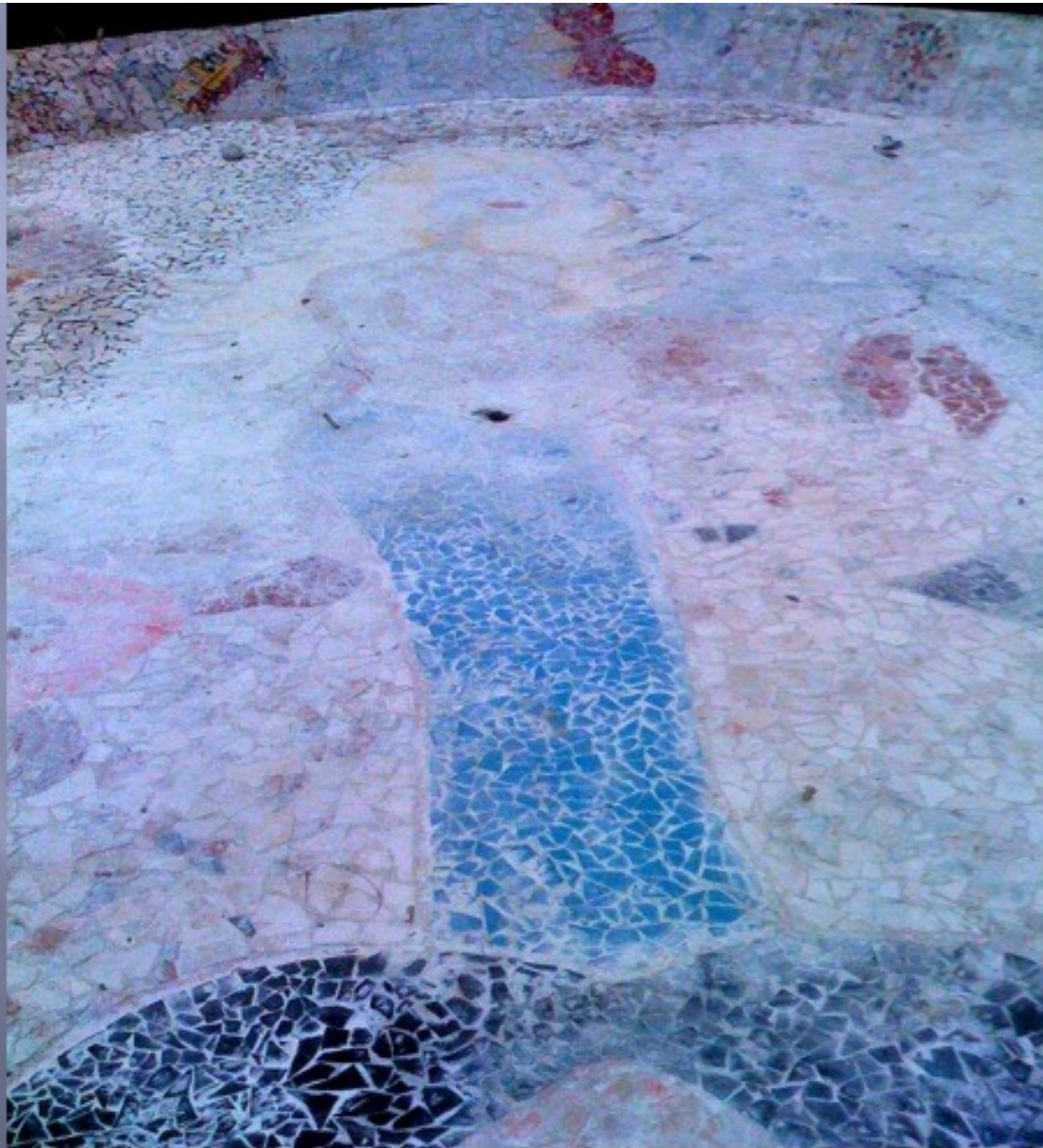
THE CENTRAL FIGURE IS A PREGNANT MERMAID