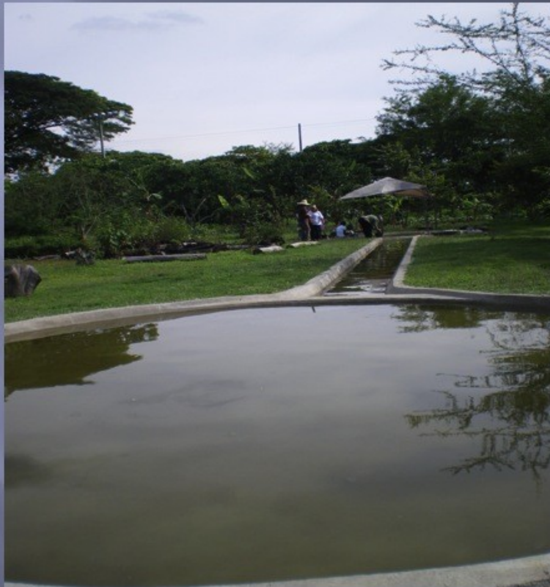
THE FOUNTAIN OF THE PASHA MAMA