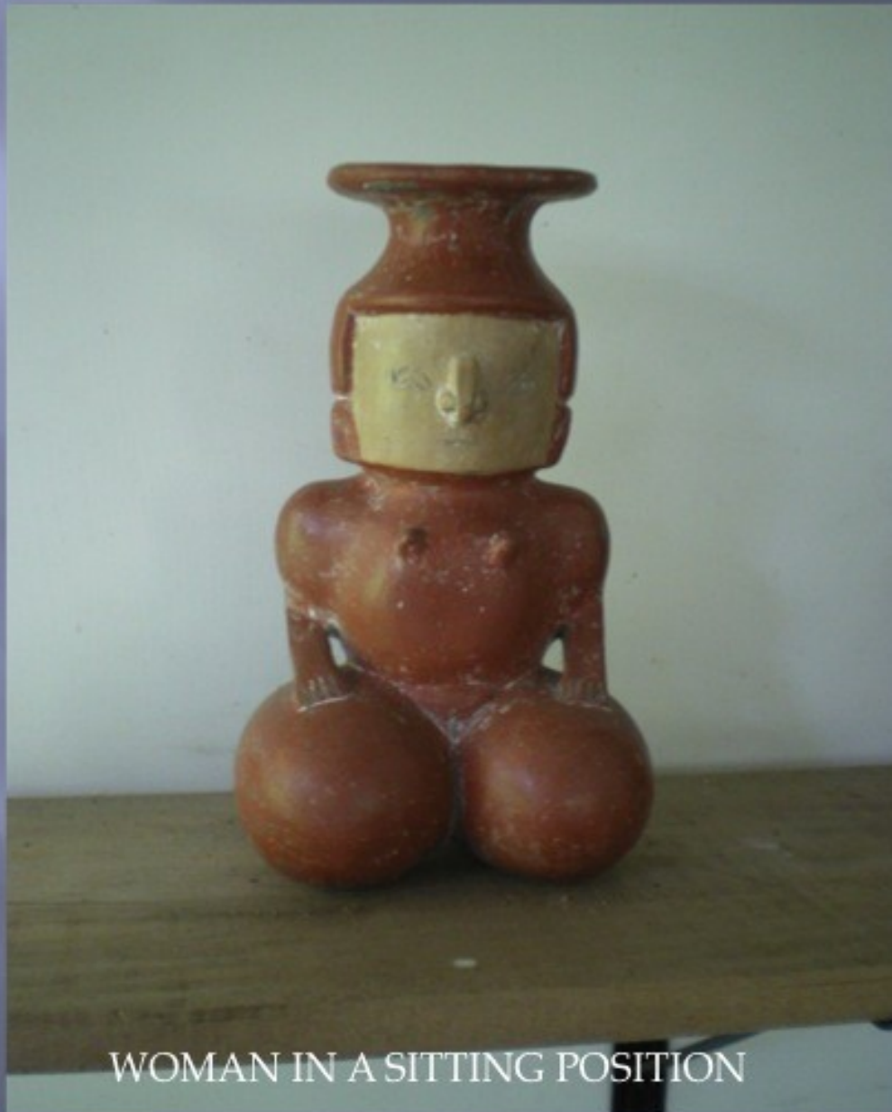
WOMAN IN A SITTING POSITION