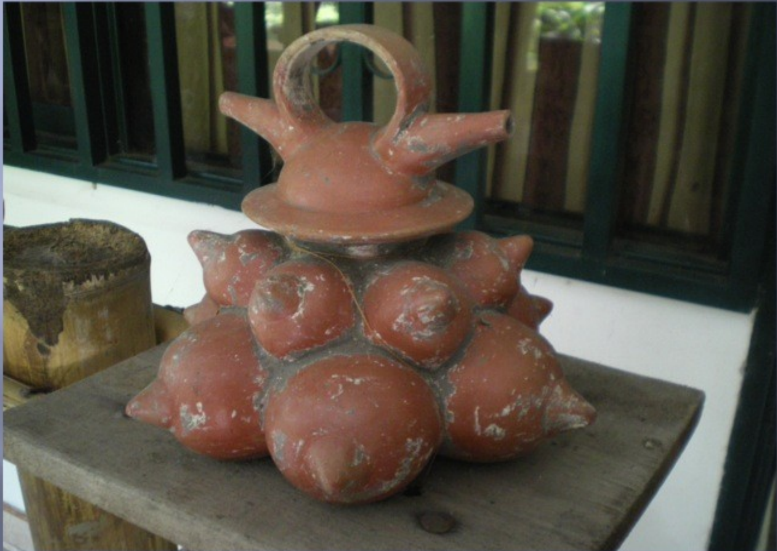
DRINKING VESSEL IN THE SHAPE OF MULTIPLE FEMALE BREASTS