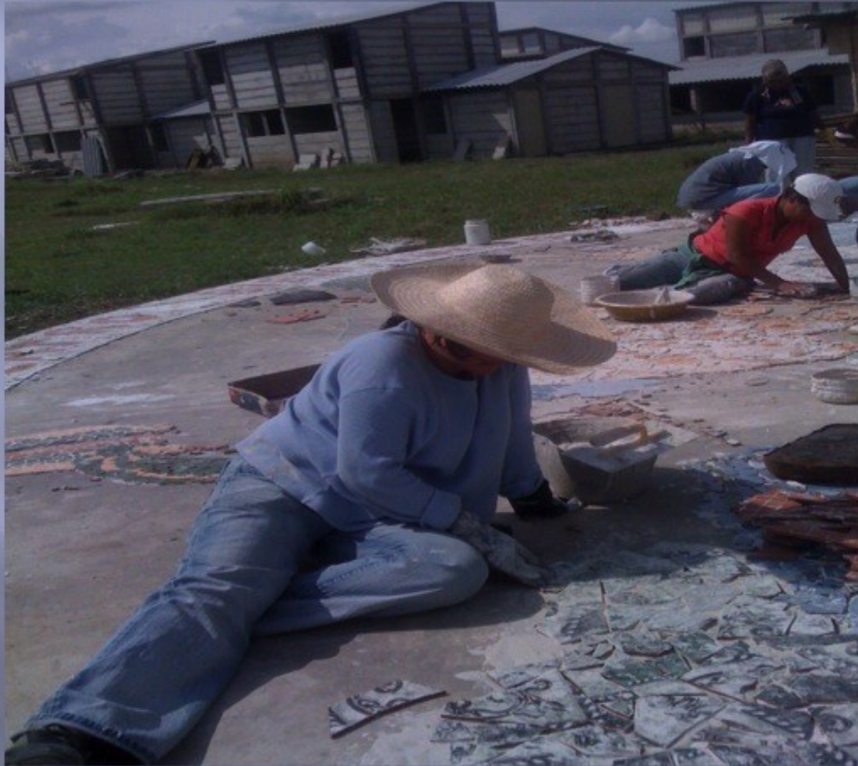
THE FLOOR OF THE AGORA WAS MADE WITH BROKEN TILES DEPICTING DIFFERENT ASPECTS OF NASHIRA