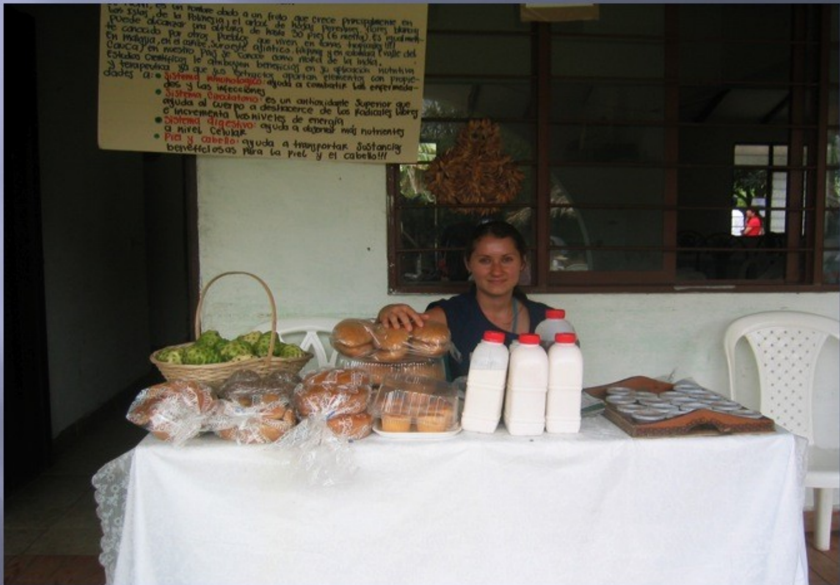
EVERY SATURDAY NASHIRA HOLDS A MARKET