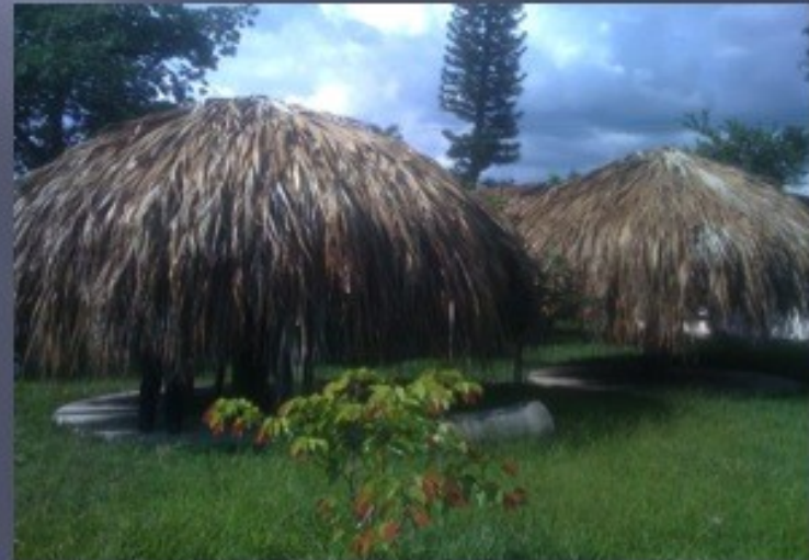
THE SOLAR RESTAURANT