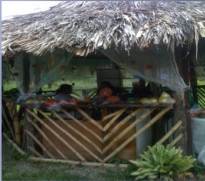
FRUIT AND VEGS MARKET