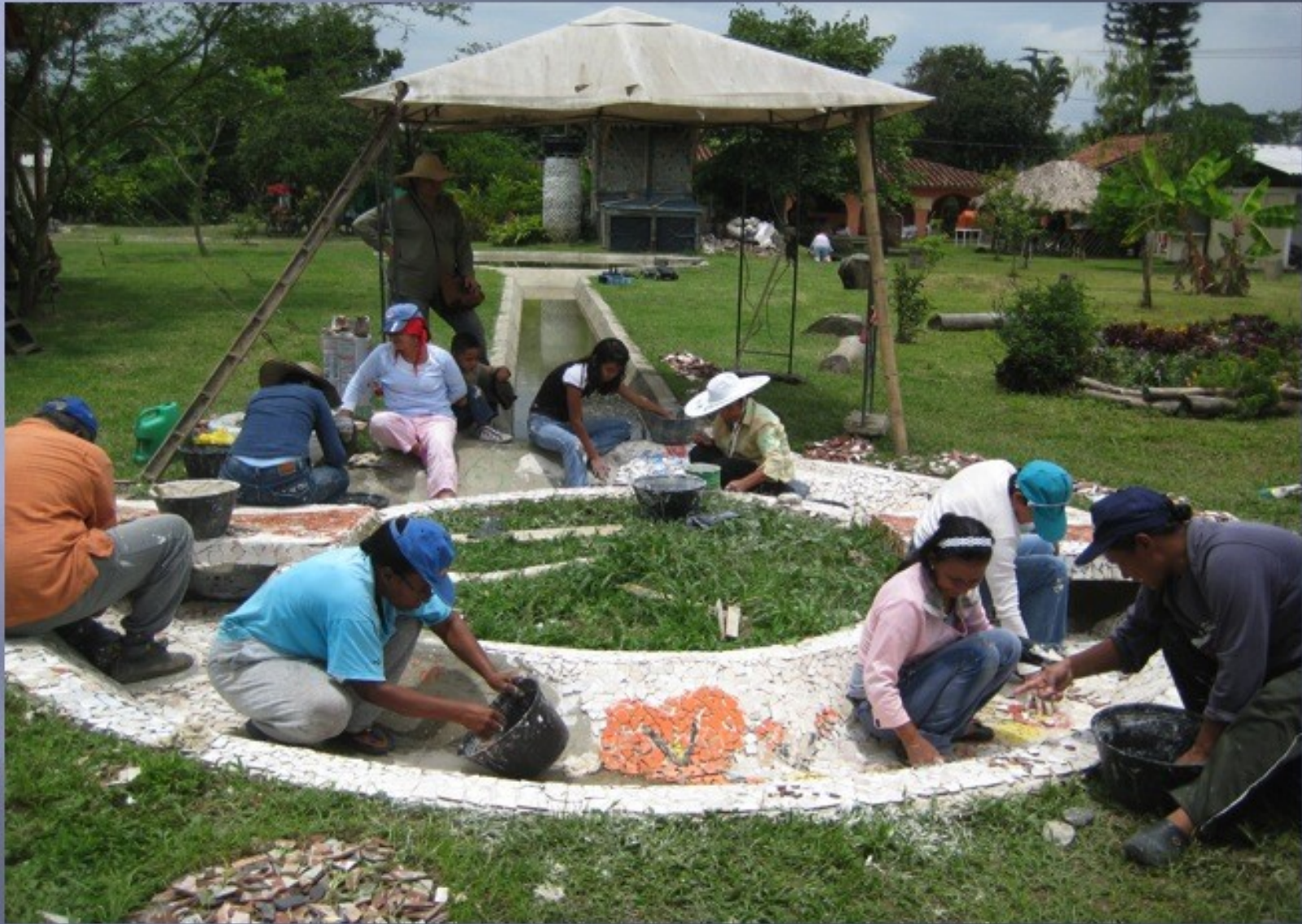
MINGA OR COLLECTIVE WORK TO DECORATE WITH BROKEN TILES THE FOUNTAIN OF THE PASHA MAMA OR MOTHER EARTH