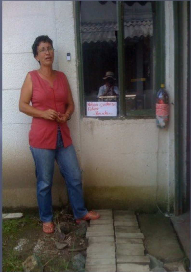
THE COMMUNITY STORE