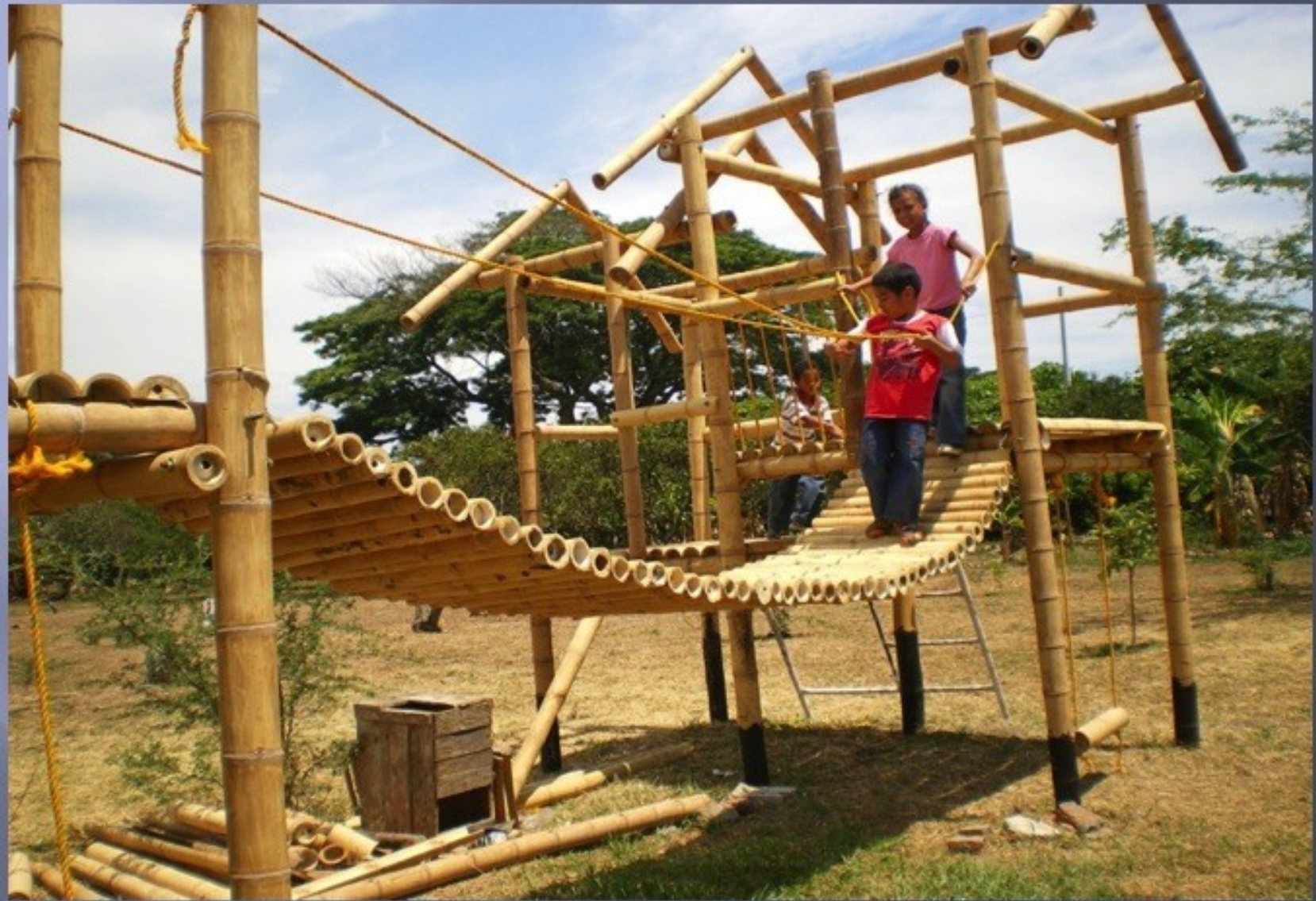
BUILDING WITH BAMBOO THE CASTLE OF THE 1000 WONDERS