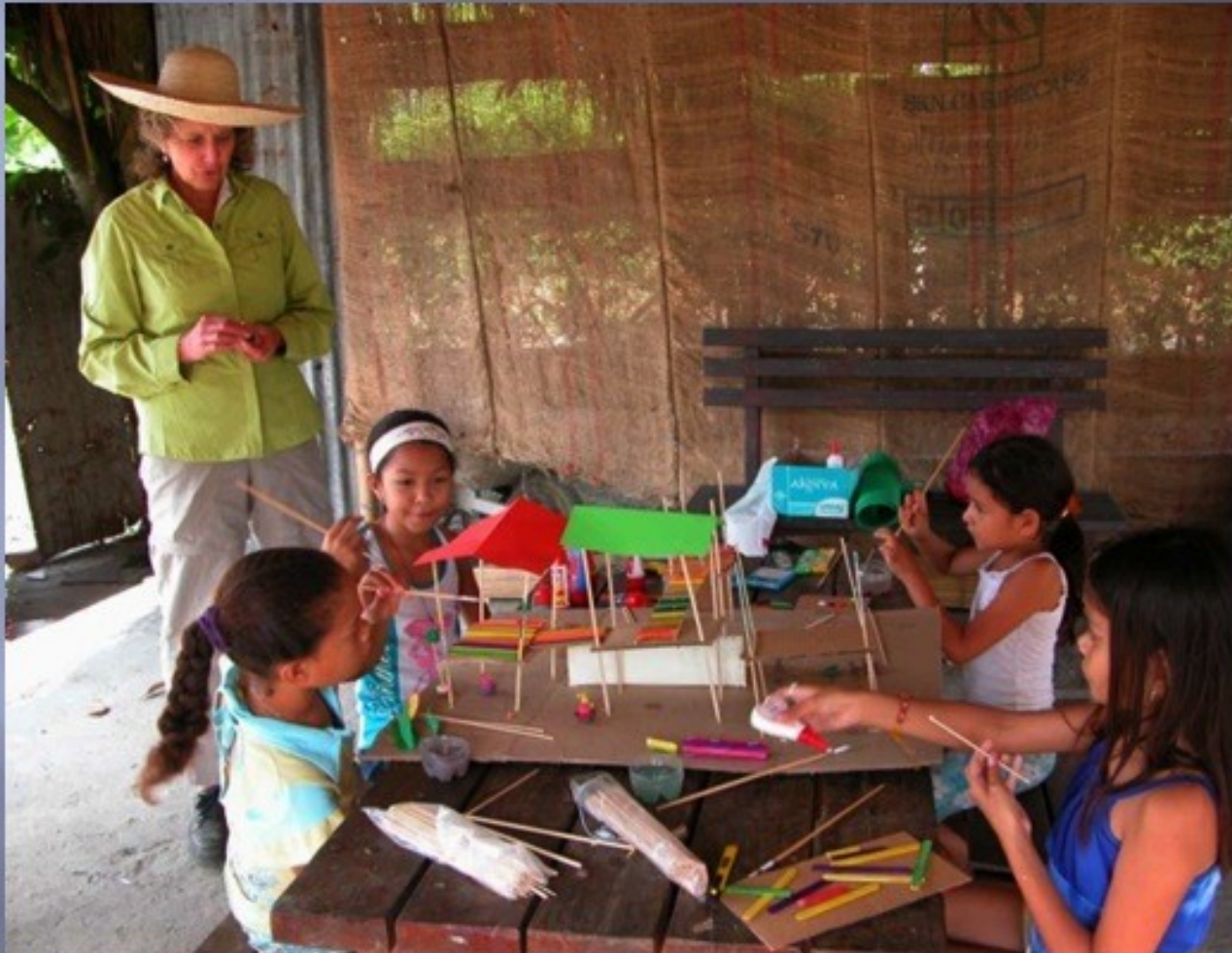
BUILDING THE CASTLE OF THE THOUSAND WONDERS