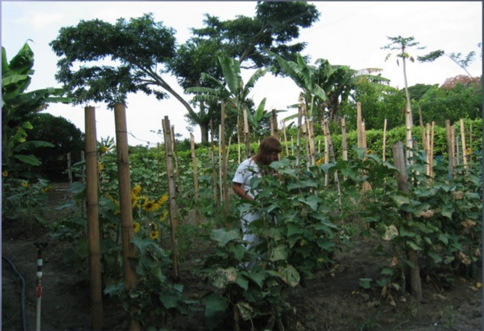
GROWING THEIR OWN FOOD